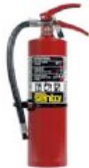
ABC Type Extinguisher